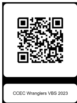
Registration QR Code